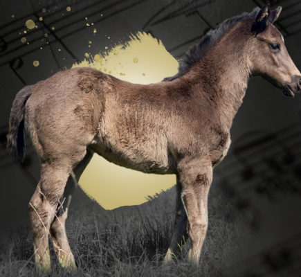
Filly ex In Her Time (Time Thief)