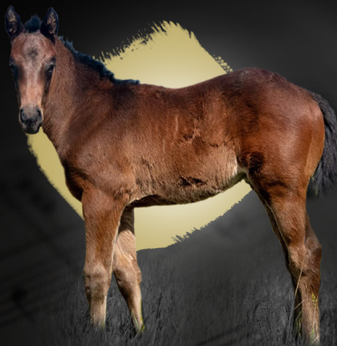
Colt ex Accepting (Dubawi)