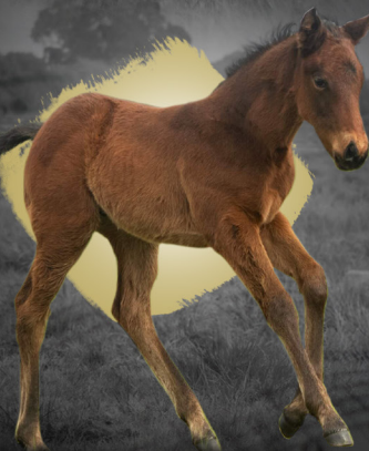
Filly ex Snapdancer (Choisir)