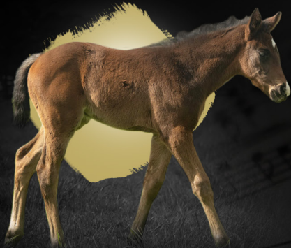
Filly ex La Girl (Not A Single Doubt)